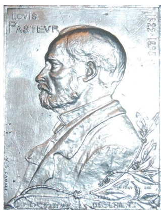
Louis Pasteur [1822-1895] tinned-lead plaque. Size 11 x 8cm [$165]

An outstanding pair of Christofle champagne coolers in an Art Deco style with elegant round ebony handles. The Christofle mark clearly visible on the base. In excellent condition with generous capacity. Height 23cm. [$1,650]